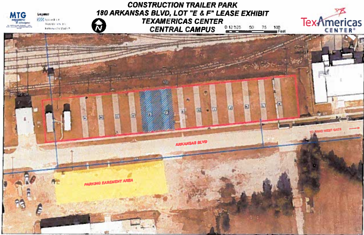
EXHIBIT "A" Premises Description