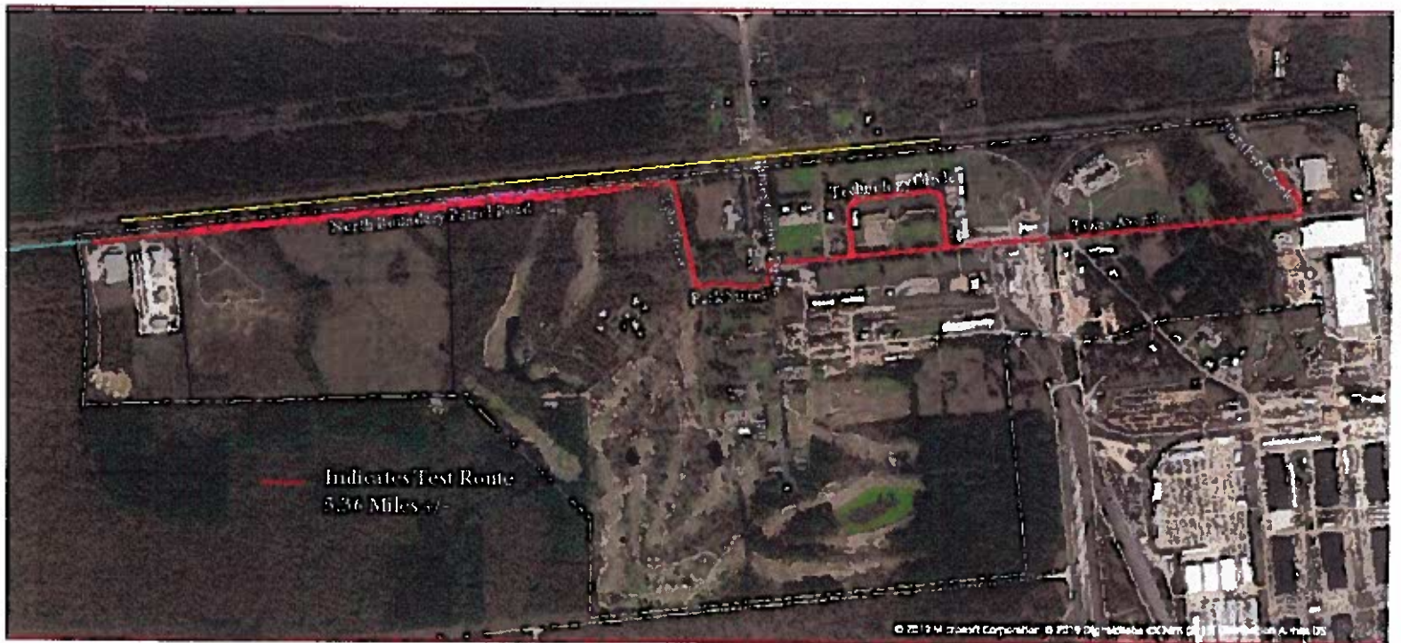
EXHIBIT "A" Premises Description